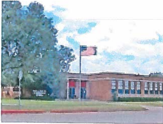
Chillicothe Child Development Center, 16140 South 6th St., in Chillicothe serves seventeen three and four-year-old children.