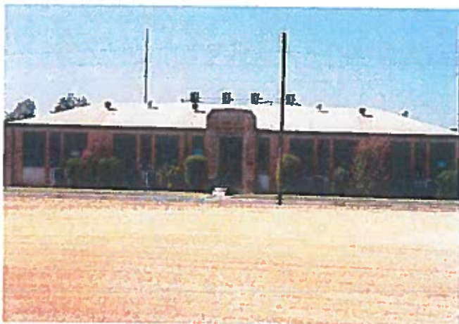
Knox Child Development Center, 300 NE 4th Street, in Knox City serves seventeen three and four-year-old children.