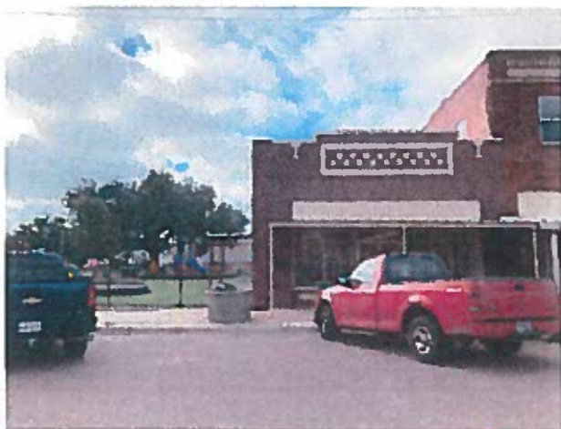
Paducah Child Development Center, 805 Richards Street, in Paducah serves fifteen three and four-year-old children.