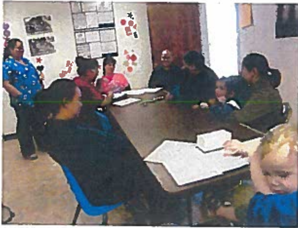
Parents learn developmentally appropriate practice.