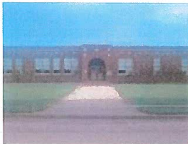
Foard County Neighborhood Center, 424 E. Logan Street, in Crowell serves seventeen three and four-year-old children.