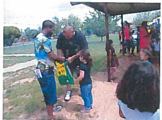
Dad and Me planting seeds to grow in the Science Center