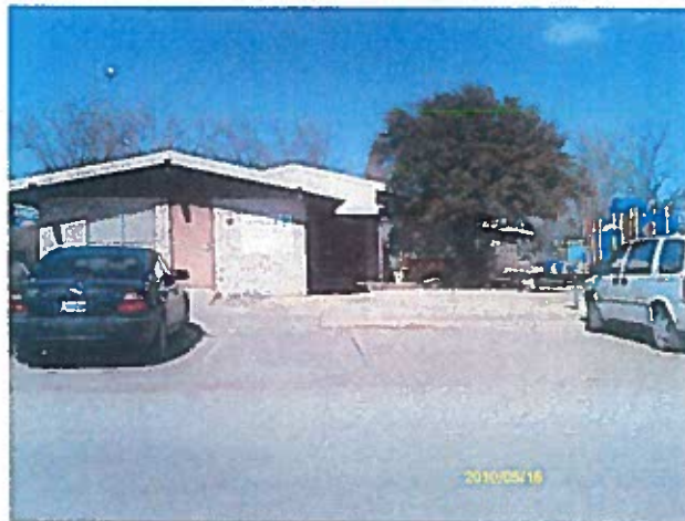
Seymour Day Care Center, 301 N. East Street, in Seymour serves seventeen three and four-year-old children.