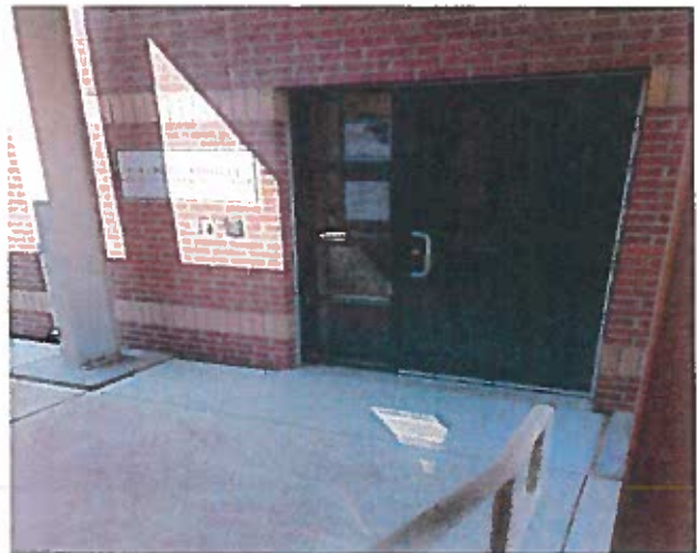
Charles Finell Child Development Center, 751 College Ave., in Holliday serves seventeen three and four-year-old children.