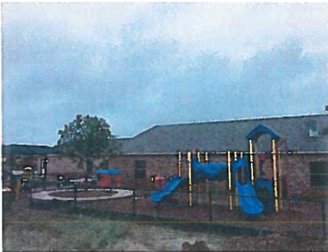
Olney Child Development Center, 207 Haggard Road, in Olney serves thirty-seven three and four-year-old children.