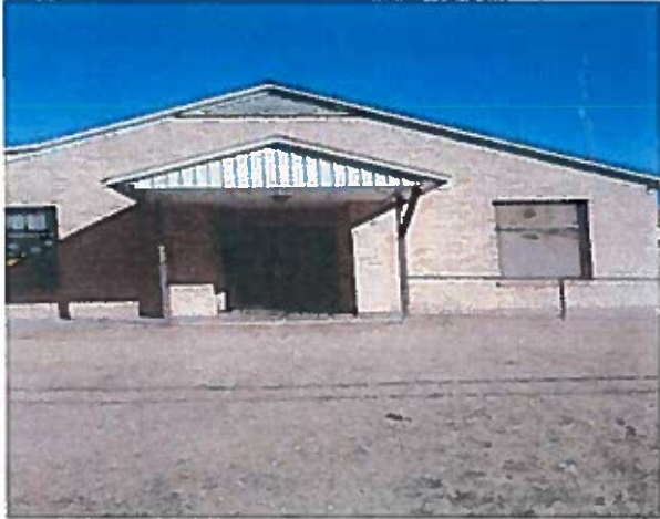
Wilbarger County Preschool, 926 Paradise Street, in Vernon serves seventy-one three and four-year-old children.