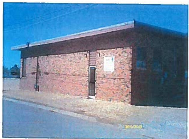
Munday Child Development Center, 941 Bowie Street, in Munday serves seventeen three and four-year-old children.