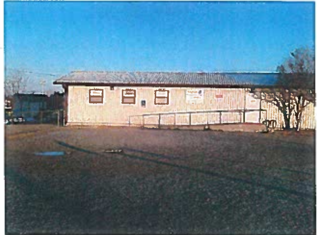
Graham Child Development Center, 1805 4th Street, in Graham serves thirty-five three and four-year-old children.